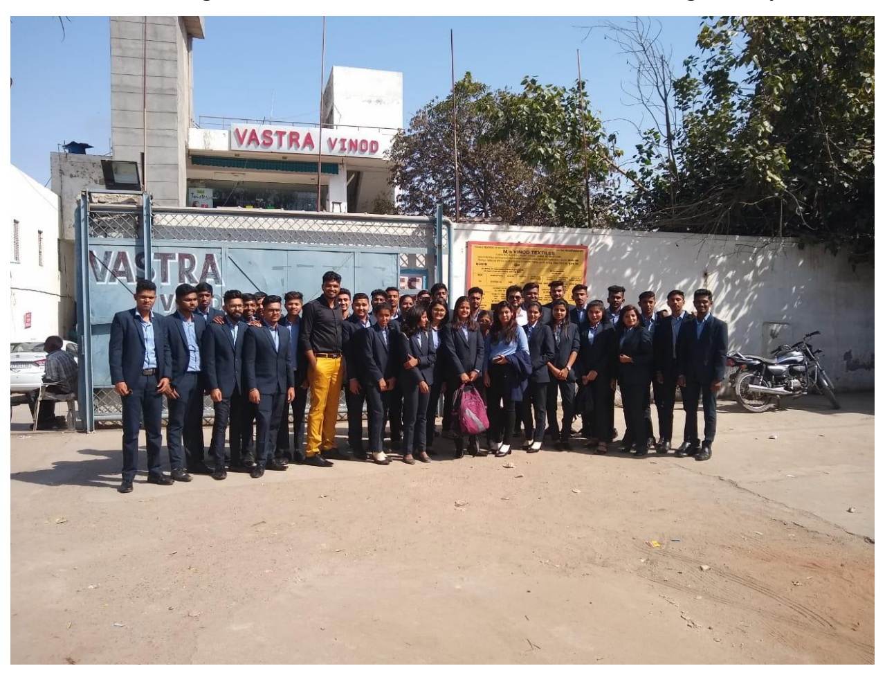
Students along with faculties at Vastra Vinod Textile Manufacturing Industry